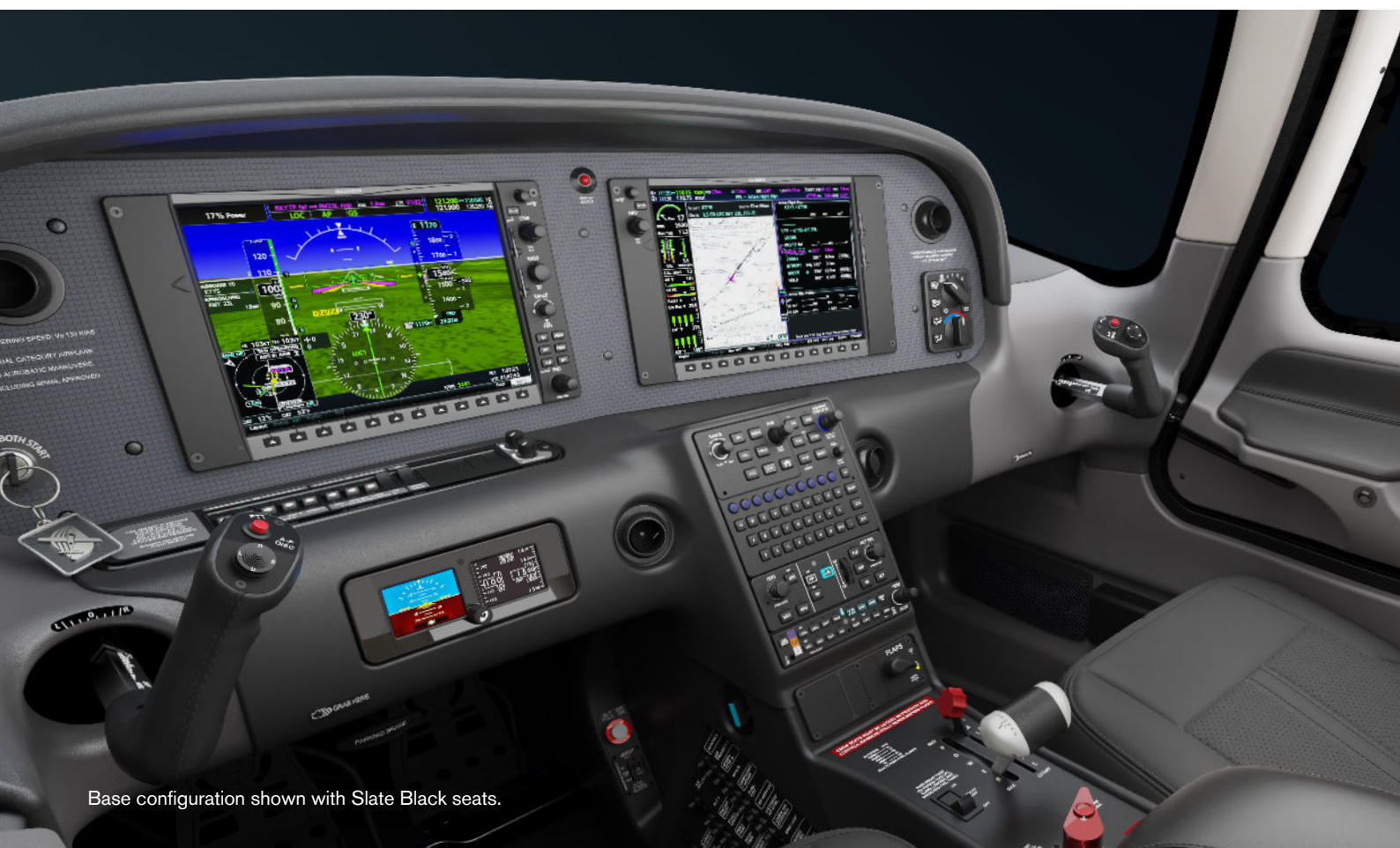
Base configuration shown with Slate Black seats.

1 Subscription Required. 2 Price does not include aircraft rental.