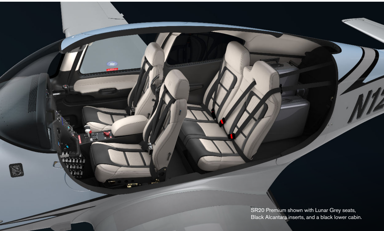
SR20 Premium shown with Lunar Grey seats, Black Alcantara inserts, and a black lower cabin.

The Premium interior is uncompromising in design, function, and comfort featuring luxurious leather, bolstered seats, and satin silver vents and lights. Expanded aesthetic flexibility provides you with the power to select from five leather colors and two cabin interiors. Add black Alcantara inserts to your seats for sporty sophistication or designate an all-leather design for timeless beauty.