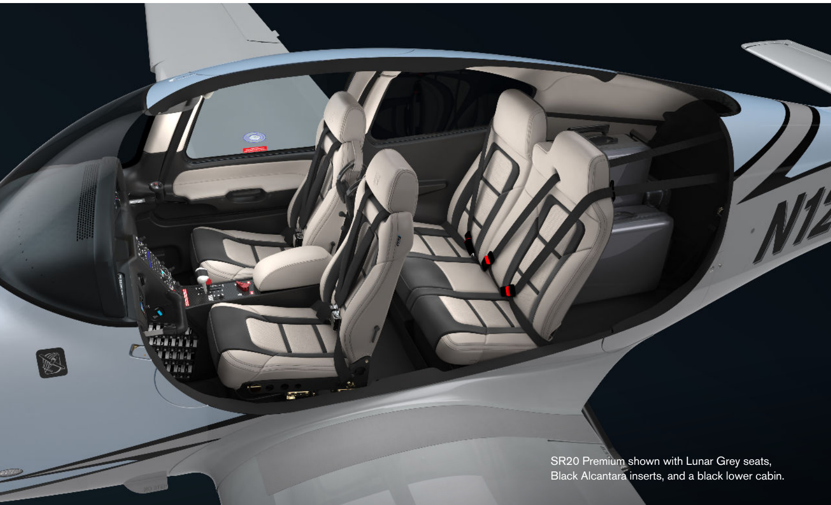
SR20 Premium shown with Lunar Grey seats, Black Alcantara inserts, and a black lower cabin.

The Premium interior is uncompromising in design, function, and comfort featuring luxurious leather, bolstered seats, and satin silver vents and lights. Expanded aesthetic flexibility provides you with the power to select from five leather colors and two cabin interiors. Add black Alcantara inserts to your seats for sporty sophistication or designate an all-leather design for timeless beauty.