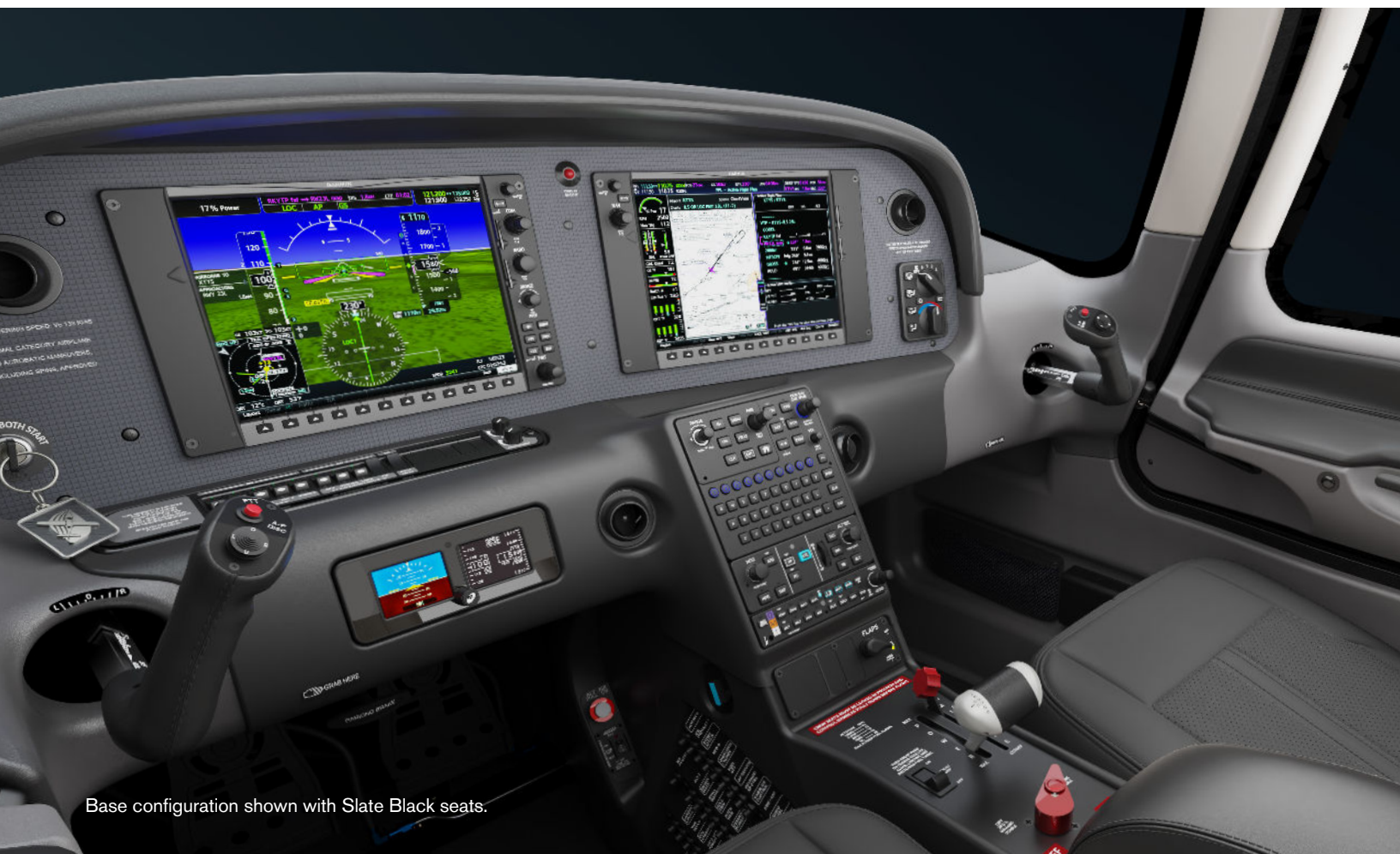
Base configuration shown with Slate Black seats.

1 Subscription Required. 2 Price does not include aircraft rental.